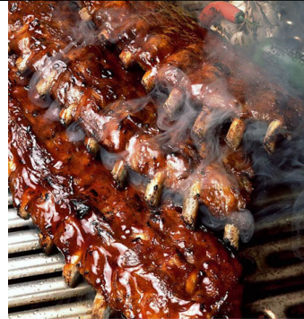
BBQ baby back ribs